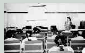
ICU awareness programme at Shardaben Hospital

We organized ICU awareness programme on Cadaver Kidney Donation on 9th January, 2008 at Shardaben Hospital, Ahmedabad. 20 ICU staff members and doctors attended the programme. We explained them importance of Cadaver Kidney Donation. We explained them 'Jivandan' programme run by IRF.