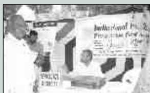
Detection camp for kidney at Trikon Baug, Rajkot