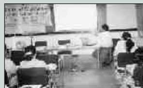
Presentation related to dialysis by Nephrologist at Ahmedabad