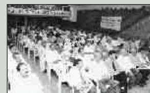
Audience during public awareness programme