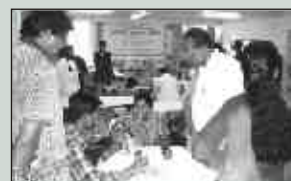
Blood Donation camp at State Bank of India Employee's Union office, Ahmedabad