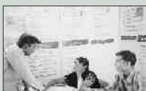
Exhibition at Surat

Exhibition at Surat: IRF participated in 'Udyog 2008' exhibition organised by Southern Gujarat Chambers of Commerce between 4th to 8th January 2008 at Vanita Vishram ground, Surat. More than 10,000 people were aware about importance of kidneys during exhibition.