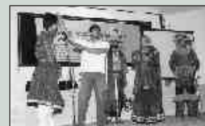
'Bhavai' performed on prevention of kidney diseases

To simplify the messages, IRF organized 'Bhavai' for the first time in Ahmedabad. A team of 8 people was invited from Vadodara to perform.